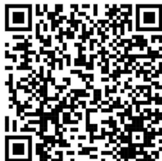
Local Area Excursion Form

Scan these with your phone camera to access!